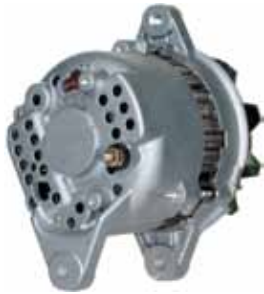
143-14103 ALT. Mitsubishi 12V 35A IR/EF