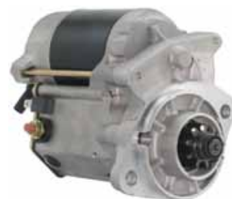
246-14101 STR. Denso 12V 1.4kW 9T OSGR