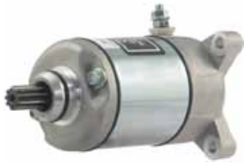
242-06119 STR. Mitsuba 12V 0.6kW 9-SPL CW