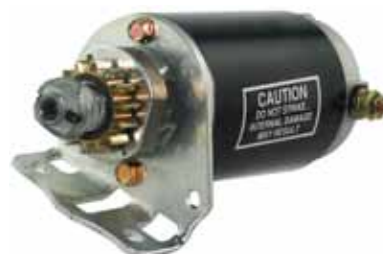
206-03115 STR. Briggs & Stratton 12V 14T CCW