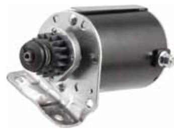
213-07103 STR. Briggs & Stratton 12V 16T CCW 97mm F/C