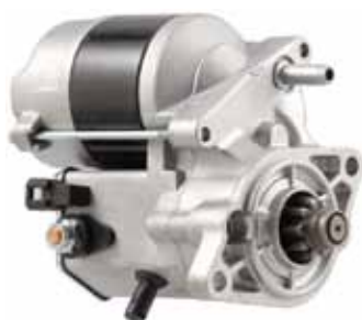
246-12108 STR. Denso 12V 1.2kW 9T CW OSGR