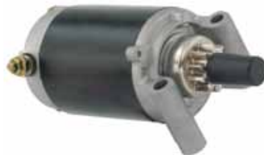
206-07120 STR. Johnson Electric / United Tech. 12V 10T CCW