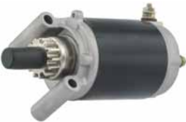
206-07113 STR. Johnson Electric / United Tech. 12V 13T CCW 88mm F/C