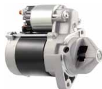
246-06124 STR. Denso 12V 0.7kW 9T CCW DD