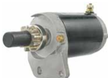
206-03102 STR. Johnson Electric / United Tech. 12V 9T CCW