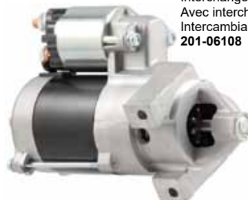
246-06101 STR. Denso 12V 0.6kW 9T CCW DD

Interchangeable with: Avec interchangeable: Intercambiable con: 201-06108 Pag. 64