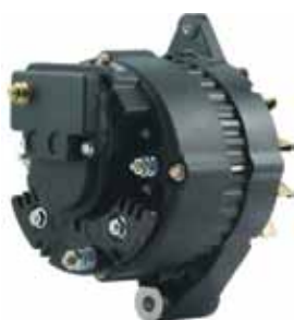
109-10100R ALT. Motorola 12V 75A