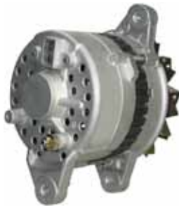
143-14105 ALT. Mitsubishi 12V 35A IR/EF