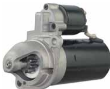
260-18102 STR. Bosch 12V 1.8kW 9T CCW PMGR