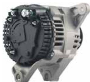
170-11102 ALT. Valeo 12V 70A IR/IF