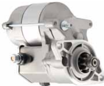
246-12105 STR. Denso 12V 1.2kW 9T CCW OSGR