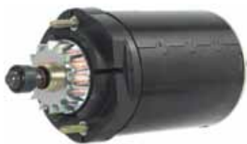
206-03120 STR. Johnson Electric / United Tech. 12V 14T CCW