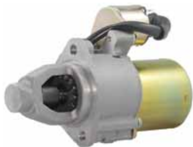
246-05102 STR. Denso 12V 0.5kW 14T CCW PMOSGR