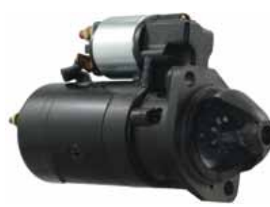
260-21110 STR. Bosch 12V 2.3kW 9T CW PLGR