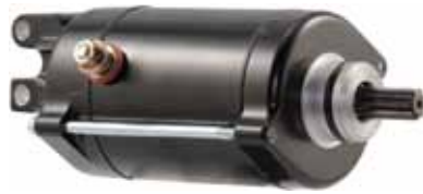
242-06124 STR. Mitsuba 12V 9-SPL CCW