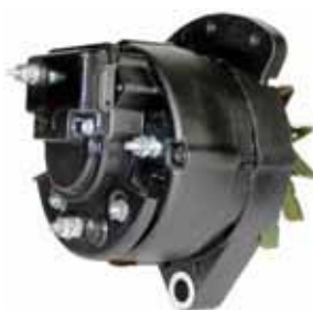
109-10106R ALT. Motorola 12V 51A