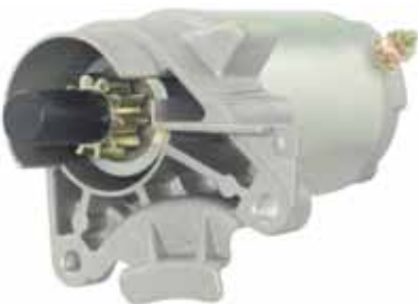
206-07125 STR. Johnson Electric / United Tech. 12V 10T CCW