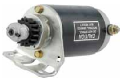
213-03104 STR. Briggs & Stratton 12V 16T CCW 108mm F/C