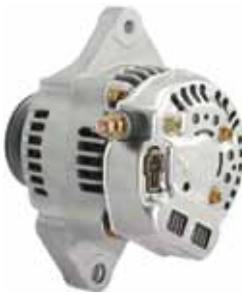
146-06137 ALT. Denso 12V 60A IR/IF