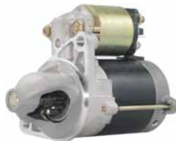
246-06112 STR. Denso 12V 0.8kW 9T CW DD