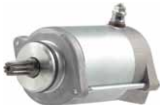
242-06156 STR. Mitsuba 12V 9-SPL, Ø11.7mm CW