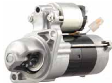
246-11105 STR. Denso 12V 1.1kW 9T CW PLGR