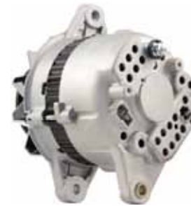
146-18104 ALT. Denso 12V 35A IR/EF