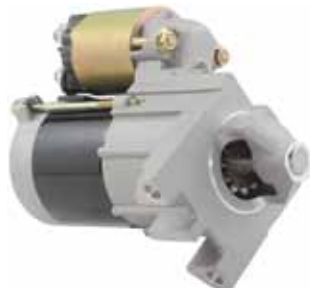
246-06114 STR. Denso 12V 0.6kW 12T CCW DD