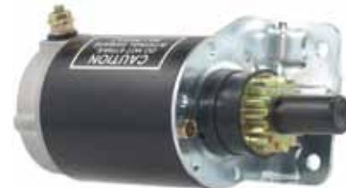
206-07123 STR. Briggs & Stratton 12V 15T CCW