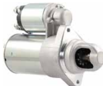
201-08101 STR. Delco 12V 0.8kW 10T CCW