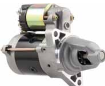
246-06123 STR. Denso 12V 0.6kW 9T CCW DD