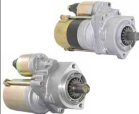
242-12105 STR. Mitsuba 12V 1.0kW 17T