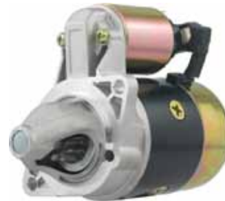
243-08105 STR. Mitsubishi 12V 0.8kW 9T