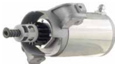
206-03121 STR. Briggs & Stratton 12V 16T CCW