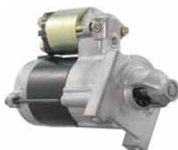
246-06117 STR. Denso 12V 0.6kW 12T CCW DD