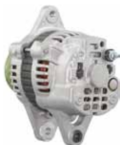
143-01101 ALT. Mitsubishi 12V 40A