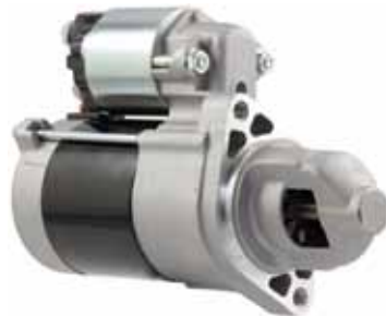
246-08102 STR. Denso 12V 0.8kW 10T CCW DD