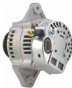
146-06132 ALT. Denso 12V 60A IR/IF