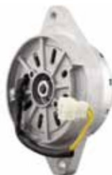
151-14105 ALT. Kokusan Denki 12V 20A