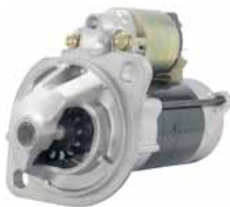
246-11104 STR. Denso 12V 1.0kW 13T CW PLGR