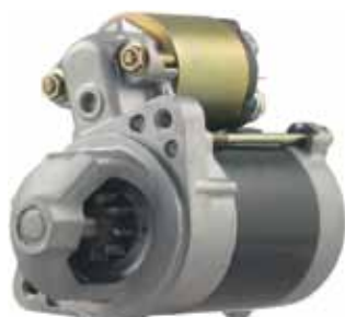
246-06122 STR. Denso 12V 9T 0.6kW CCW DD