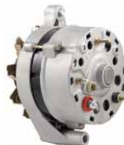
102-01100R ALT. Ford 1G 12V 40A