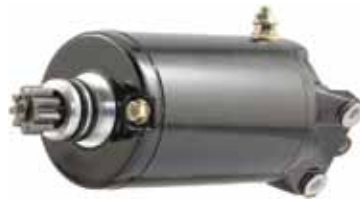
242-06152 STR. Mitsuba 12V 9T CCW