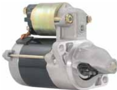
246-06106 STR. Denso 12V 0.6kW 9T CCW DD