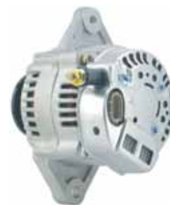
146-93119 ALT. Denso 12V 45A IR/IF