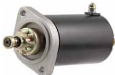
206-04119 STR. Johnson Electric / United Tech. 12V 9T CW 129mm F/C