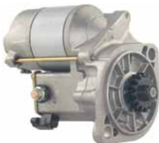
246-14116 STR. Denso 12V 1.0kW 15T CW OSGR