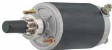
206-03101 STR. Johnson Electric / United Tech. 12V 9T CCW