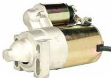
201-06109 STR. Delco 12V 0.8kW 8/9T CCW