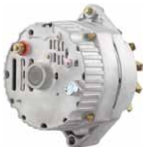
101-10103 ALT. Delco 10SI 12V 63A