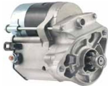
246-10111R STR. Denso 12V 1.0kW 9T