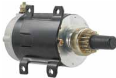
206-07115 STR. Johnson Electric / United Tech. 12V 16T CCW