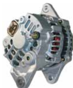
143-08105 ALT. Mitsubishi 12V 40A