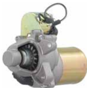
242-06109 STR. Mitsubishi 12V 0.4 kW 17T CCW PMDD