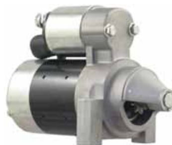
240-08103 STR. Hitachi 12V 0.8kW 9T CCW