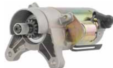
246-06134 STR. Denso 12V 0.6kW 14T CCW PMDD