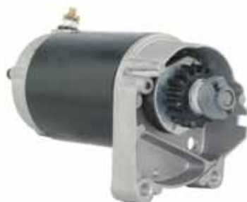
206-07102 STR. Briggs & Stratton 12V 16T CCW 88mm F/C