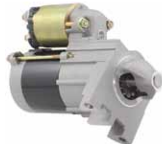
246-06115 STR. Denso 12V 0.6kW 12T CCW DD