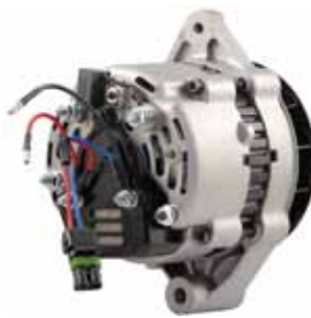
141-25104 ALT. Mando 12V 55A