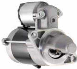
246-06181R STR. Denso 12V 9T