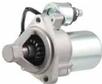
246-05103 STR. Denso 12V 0.5kW 14T CCW PMOSGR