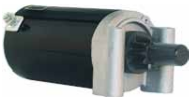
206-04118 STR. Johnson Electric / United Tech. 12V 10T CCW