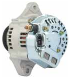
146-93101 ALT. Denso 12V 40A IR/IF