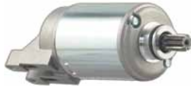
246-06145 STR. Denso 12V 9-SPL CW PMDD