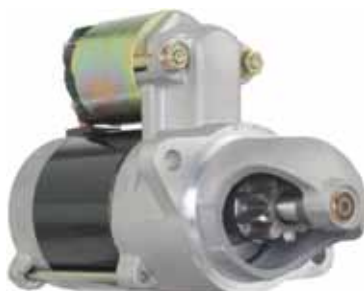
246-06103 STR. Hitachi 12V 0.6kW 9T CCW DD