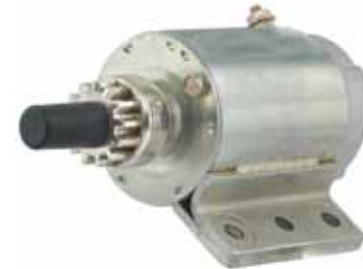
206-07118 STR. Johnson Electric / United Tech. 12V 13T CCW