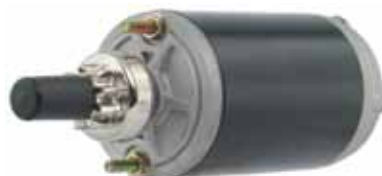
206-03110 STR. Johnson Electric / United Tech. 12V 9T CCW 103mm F/C