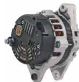
141-30102 ALT. Mando 12V 90A