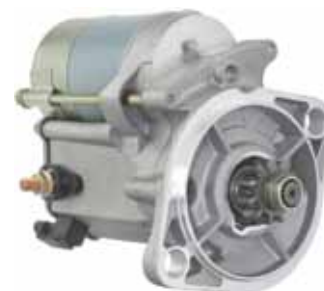
246-15115 STR. Denso 12V 1.0kW 11T CW OSGR