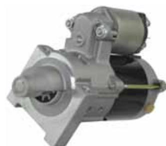
246-06119 STR. Denso 12V 9T 0.6kW CCW DD