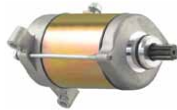
242-06127 STR. Mitsuba 12V 9-SPL CCW