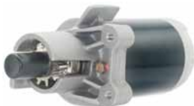
206-03113 STR. Johnson Electric / United Tech. 12V 10T CCW