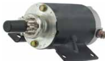
206-03111 STR. Tecumseh 12V 11T CCW 103mm F/C