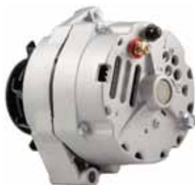
101-10104 ALT. Delco 10SI 12V 63A