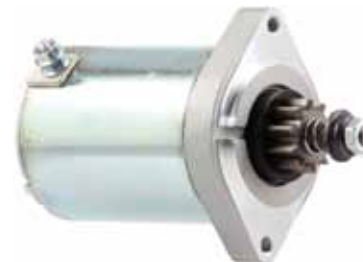
206-07131 STR. Johnson Electric / United Tech. 12V 10T CCW