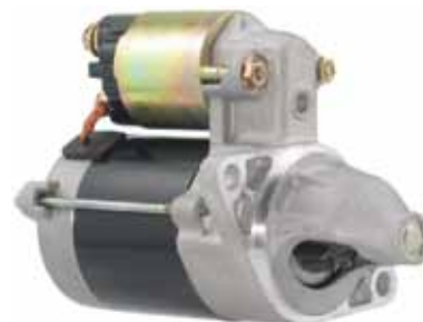
246-06107 STR. Denso 12V 0.6kW 9T CW DD