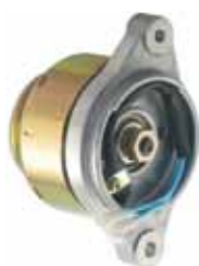
151-14102 ALT. Kokusan Denki 12V 14A