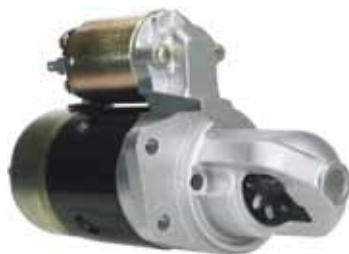
243-10103 STR. Mitsubishi 12V 0.8kW 9T CCW