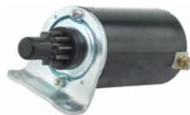
206-04117 STR. Johnson Electric / United Tech. 12V 10T CCW 129mm F/C