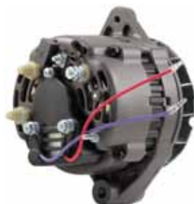
141-25103 ALT. Mando 12V 65A