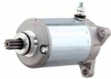
246-06153 STR. Denso 12V 9-SPL CCW PMDD