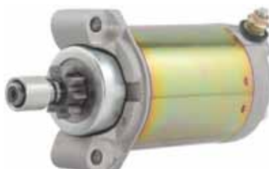
246-06133 STR. Denso 12V 0.6kW 9T CCW PMDD