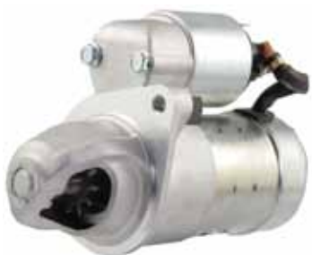
240-14117 STR. Hitachi 12V 1.2kW 11T CCW