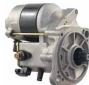
246-12106 STR. Denso 12V 9T 1.2kW CW OSGR