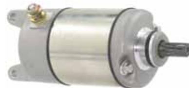
242-06113 STR. Mitsubishi 12V 9-SPL CCW