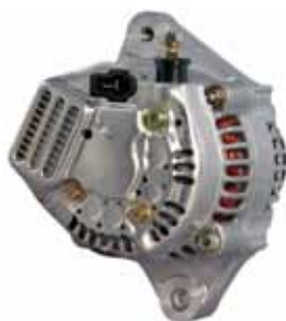
146-93109R ALT. Denso 12V 40A IR/IF