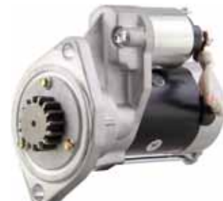
240-20104 STR. Hitachi 12V 2.0kW 15T OSGR