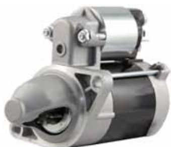
246-06102 STR. Denso 12V 0.6kW 9T CCW DD

Interchangeable with: Avec interchangeable: Intercambiable con: 201-06108 Pag. 64