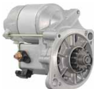
246-14159 STR. Denso 12V 1.4kW 13T CW OSGR