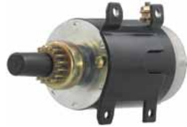
206-07112 STR. Tecumseh 12V 16T CCW