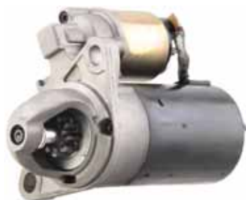
260-14120 STR. Denso 12V 1.4kW 9T CW PMGR