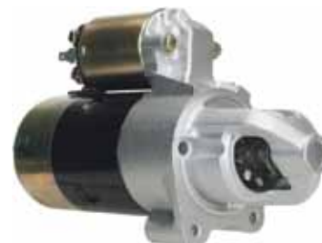
243-10104 STR. Mitsubishi 12V 0.8kW 9T CCW