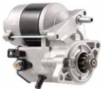
246-15119 STR. Denso 12V 1.4kW 9T CW