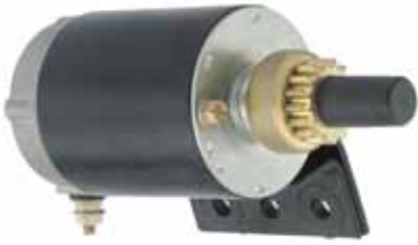
206-07110 STR. Johnson Electric / United Tech. 12V 16T CCW 88mm F/C