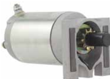
206-04114 STR. Johnson Electric / United Tech. 12V 10T CCW