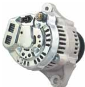
146-93106 ALT. Denso 12V 40A IR/IF