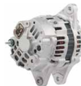
143-08111 ALT. Mitsubishi 12V 40A