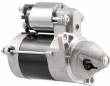
246-06180 STR. Denso 12V 9T 0.6kW CCW DD