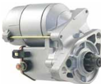
246-12109R STR. Denso 12V 1.2kW 9T CW OSGR