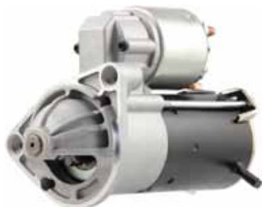
270-06101 STR. Valeo 12V 0.6kW 9T CW PMGR