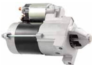
246-06125 STR. Denso 12V 0.8kW 15T CCW DD