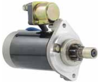
246-06136 STR. Denso 12V 0.6kW 9T CCW PMDD