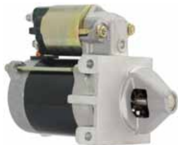
246-06105 STR. Denso 12V 0.7kW 9T CCW DD