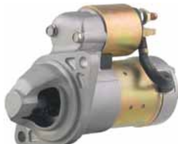
240-14118 STR. Hitachi 12V 1.4kW 9T CW PMGR