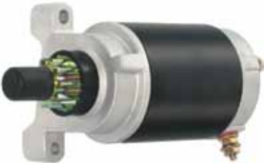
206-07119 STR. Tecumseh 12V 10T CCW