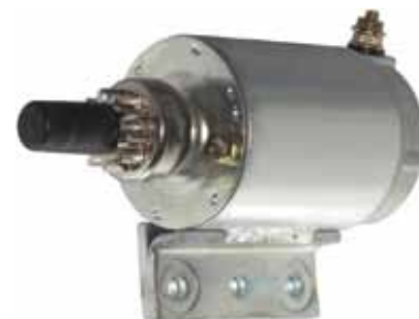
206-07101 STR. Johnson Electric / United Tech. 12V 10T CCW