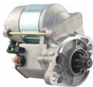
246-14163 STR. Denso 12V 1.2kW 9T CW OSGR