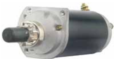
206-04109 STR. Johnson Electric / United Tech. 12V 9T CCW 129mm F/C