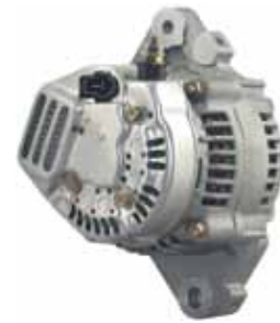
146-06109R ALT. Denso 12V 60A IR/IF