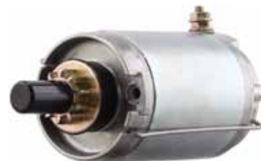
206-07130 STR. Johnson Electric / United Tech. 12V 10T CCW