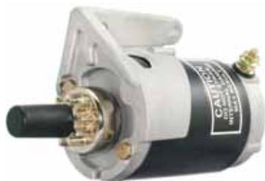
206-07106 STR. Johnson Electric / United Tech. 12V 10T CCW 88mm F/C