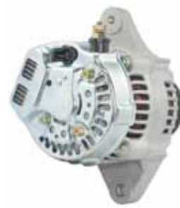
146-93105 ALT. Denso 12V 40A IR/IF