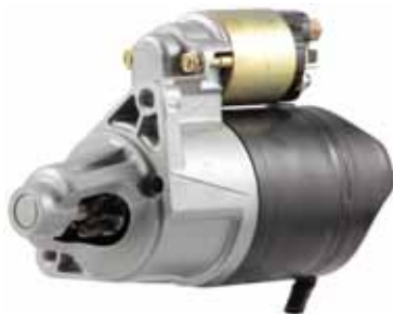
246-08100R STR. Denso 12V 0.8kW 9T