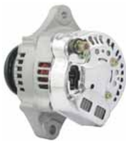
146-93104 ALT. Denso 12V 40A IR/IF