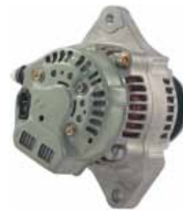
146-06136 ALT. Denso 12V 55A IR/IF