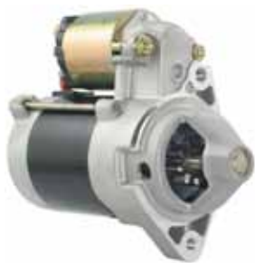
246-06109 STR. Denso 12V 0.85kW 9T/11T CCW DD