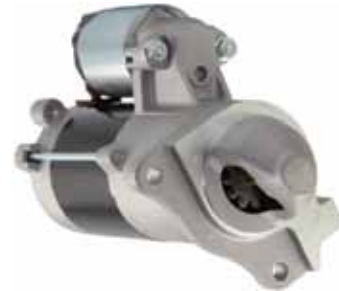
246-06182R STR. Denso 12V 12T