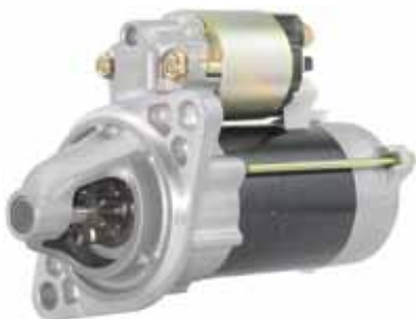
246-11102 STR. Denso 12V 1.1kW 9T CW PLGR