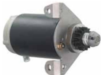
206-03109 STR. Briggs & Stratton 12V 16T CCW 103mm F/C