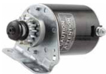
213-07122 STR. Briggs & Stratton 12V 14T CCW