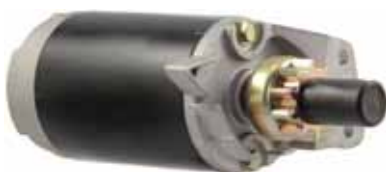
206-03112 STR. Johnson Electric / United Tech. 12V 10T CCW