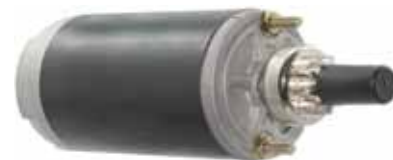
206-04105 STR. Johnson Electric / United Tech. 12V 9T CCW 122mm F/C