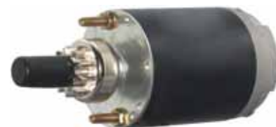
206-07109 STR. Johnson Electric / United Tech. 12V 10T CCW 88mm F/C