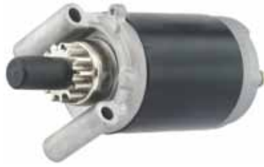
206-07111 STR. Johnson Electric / United Tech. 12V 13T CCW 88mm F/C