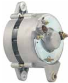
146-18103 ALT. Denso 12V 25A ER/EF