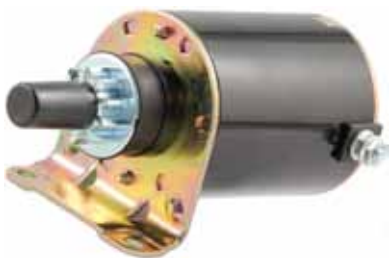
206-07132 STR. Johnson Electric / United Tech. 12V 10T CCW