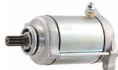
242-06155 STR. Mitsuba 12V 9-SPL CW