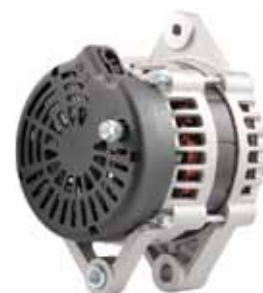
110-14101 ALT. John Deere 12V 75A