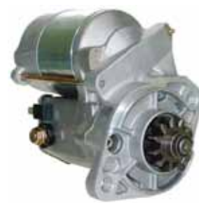
246-14129 STR. Denso 12V 0.8kW 9T