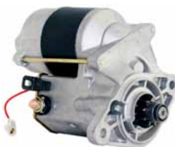
246-14119 STR. Denso 12V 1.4kW 9T OSGR