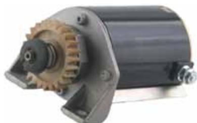
213-10103 STR. Briggs & Stratton 12V 24T CCW