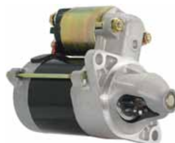
246-06104 STR. Denso 12V 0.7kW 9T CCW DD