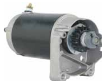
206-03108 STR. Briggs & Stratton, 103mm F/C 12V 16T CCW