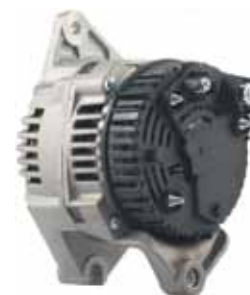
170-11101 ALT. Valeo 12V 70A IR/IF