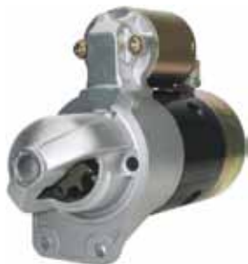
243-10102 STR. Mitsubishi 12V 1.0kW 9T CCW