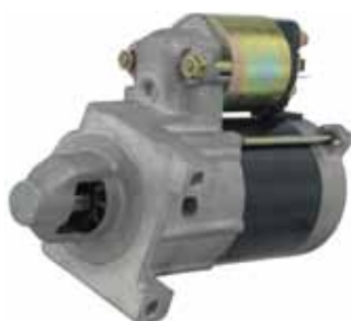
246-06116 STR. Denso 12V 0.6kW 9T CCW DD