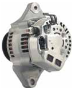
146-06127 ALT. Denso 12V 60A IR/IF