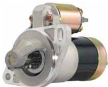
246-11106 STR. Denso 12V 1.2kW 9T CW PLGR