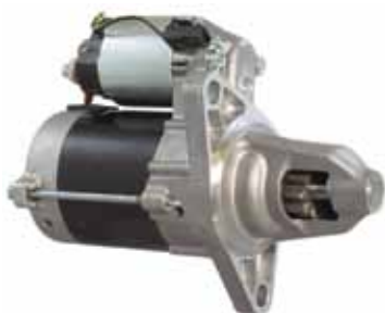
246-06113 STR. Denso 12V 0.7kW 9T CCW DD