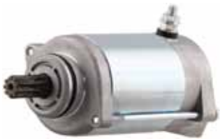
242-06139 STR. Mitsuba 12V 9-SPL, Ø14.3mm