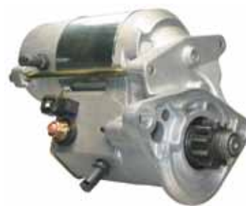
246-20110 STR. Denso 12V 2.0kW 11T OSGR