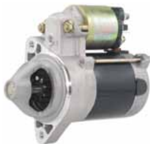
246-06110 STR. Denso 12V 0.7kW 9T CCW DD