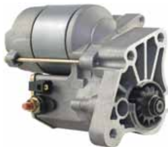
246-15121R STR. Denso 12V 1.4kW 13T CW