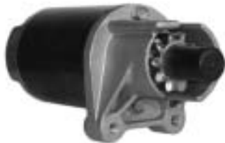
206-03113 12V, CCW, 10 Teeth

Replaces: John Deere: AM37869, AM119837 Kohler: 45-098-01, -03, -05, -07, -09 UT: 0599440MO30SM, 1250740MO30SM, 1635340MO30SM, 5666140MO30SM, SM05994, SM16353, SM56661 Application: Kohler: High Mount K241, 301, 321, 341, 10-16 HP Eng.