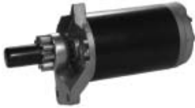
206-03112 12V, CCW, 10 Teeth

Replaces: John Deere: AM32393 Onan: 191-1529, 191-1567 UT: 4367240MO30SM, 4379040MO30SM, SM43672, SM43790 Application: Onan: B43G, B48G Eng.