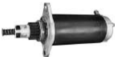
206-04104 12V, CCW, 16 Teeth

Replaces: B & S: 391423, 392749, 394805, 435303, 497595, 693054 UT: SM01965 Application: B & S: Single Cyl; 5, 6, 8, 10, 11 HP Eng.