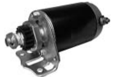
206-07103 12V, CCW, 16 Teeth

Replaces: Cushman: 884218, 884982, 885002 UT: 2020040MO30SM, 5710440MO30SM, SM20200, SM57104 Application: Cushman: Air Cooled Eng.