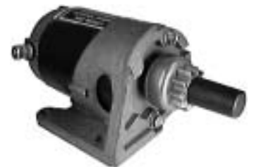
206-07106 12V, CCW, 10 Teeth

Replaces: John Deere: AM37725 Kohler: 45-098-04, 48-098-02, 48-098-04 UT: 1574540MO30SM, 5665940MO30SM, SM15745, SM56659, SMH12C1 Application: Kohler: K482, K532, K582; 18-23 HP Eng.