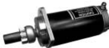
206-04109 12V, CCW, 9 Teeth

Replaces: Onan: 191-1667 UT: 6013840MO30SM, SM60138 Application: Onan: BGD, BGD L, MCE NHD, NHDL, NHE, NHEL, MHM Eng. RV/Commercial