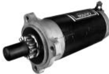
206-04108 12V, CCW, 13 Teeth

Replaces: Onan: 191-1828 UT: 5082740MO30SM, SM50827 Application: Onan: 16-20 HP Eng.