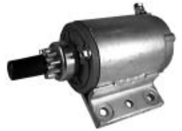
206-07101 12V, CCW, 10 Teeth

Replaces: John Deere: AM37869, AM119837 Kohler: 45-098-01, -03, -05, -07, -09 UT: 0599440MO30SM, 1250740MO30SM, 1635340MO30SM, 5666140MO30SM, SM05994, SM16353, SM56661 Application: Kohler: High Mount K241, 301, 321, 341, 10-16 HP Eng.