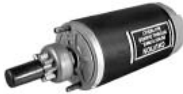
206-04105 12V, CCW, 9 Teeth

Replaces: Kohler: 52-098-06, 52-098-10, 52-098-13, 52-098-135 UT: 2134940MO30SM, 5213240MO30SM, 5666440MO30SM, SM21349, SM52132, SM56664 Application: Kohler: KT19, KT21, MV20, M18, M20, 17-20 HP Eng.